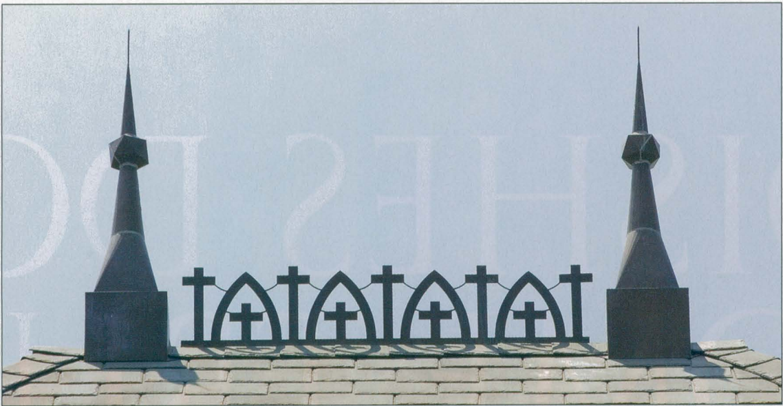
Copper crosses add a Gothic accent to the roofline of the 7,000-plus-square-foot home. Below, the metal accents continue inside with these copper awnings, used instead of traditional window coverings, and which provide ample decoration without sacrificing the view of the pool outside.