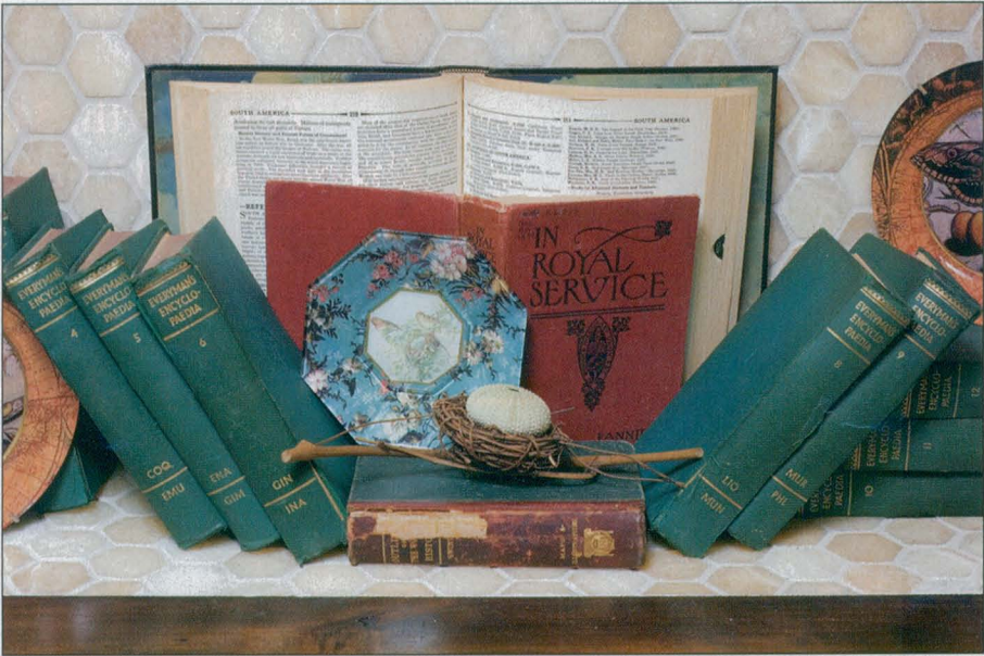
A tiled niche in the breakfast room holds a collection of artfully placed antique books, dessert plates, saucers and a bird's nest.