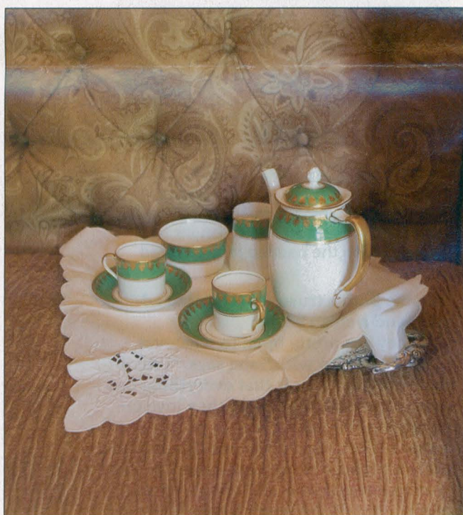
In the sitting room, the tufted niche seat holds Nicole's great-grandmother's bright green and gold-rimmed Old Royal China from England.

Another soothing place in the home is the master bedroom, where an antiqued pine tongue-and-groove cathedral ceiling, hand-scraped teak floors and a fireplace accent a calm cream-on-cream color scheme. A large fireplace warms the spacious but cozy master bath, the highlight of which is a walk-in closet