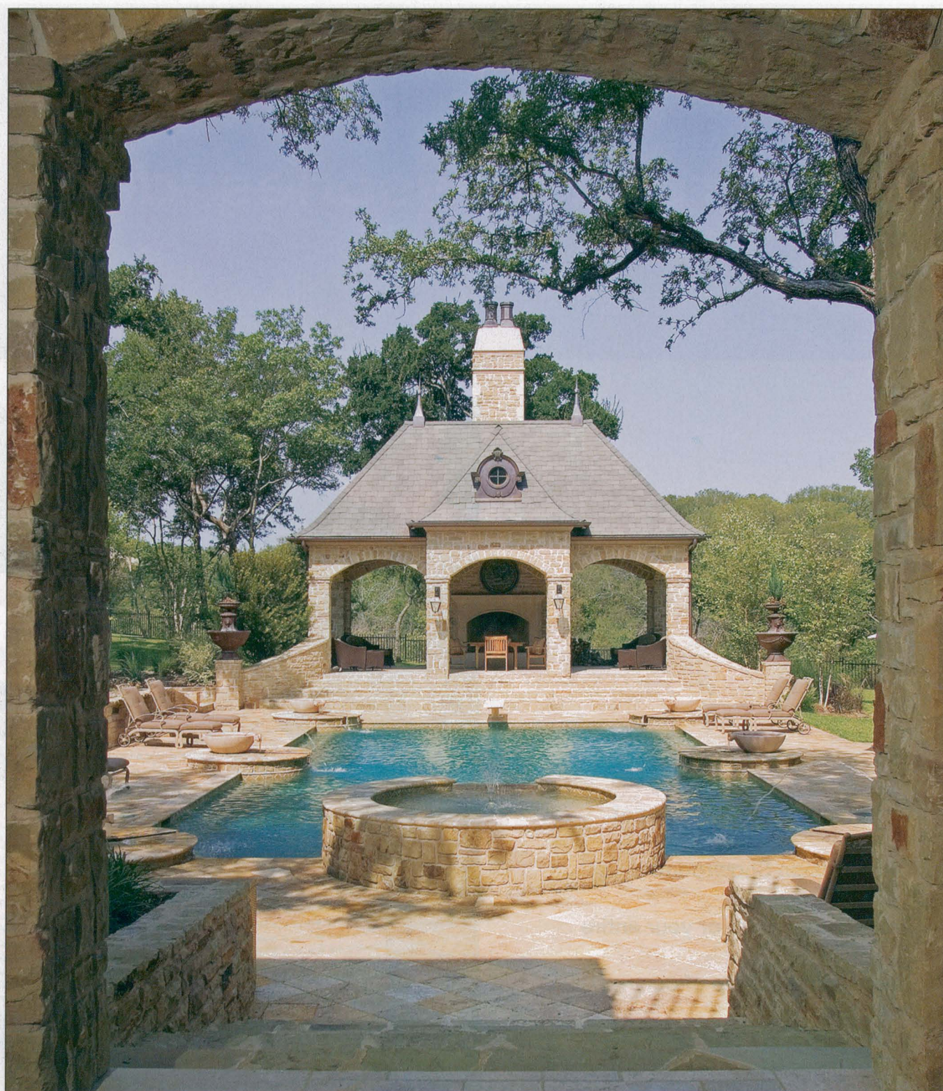
The saltwater pool beckons visitors through the back windows. At the far end, a covered outdoor living space features a wood-burning fireplace and seating areas. At left is a part of the Zimmermans' parklike back yard. Trees and an inlaid concrete chessboard dot the landscape.