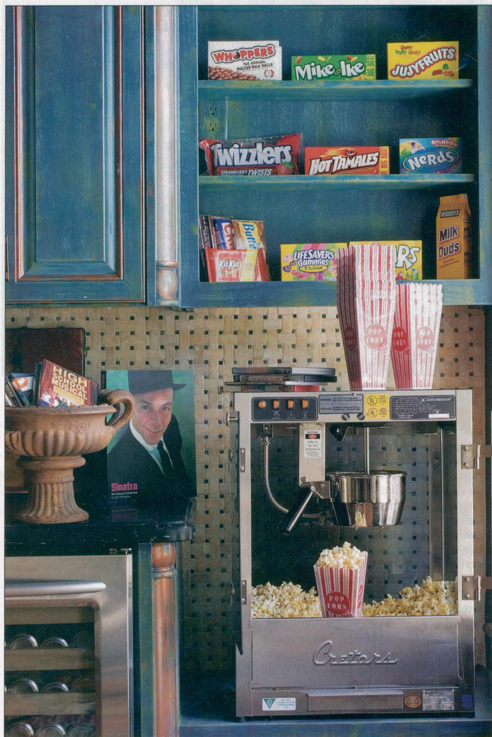
Off the media room is a snack station, complete with a popcorn machine, all the favorite snacks, a small refrigerator for drinks and peacock-blue glazed cabinets.