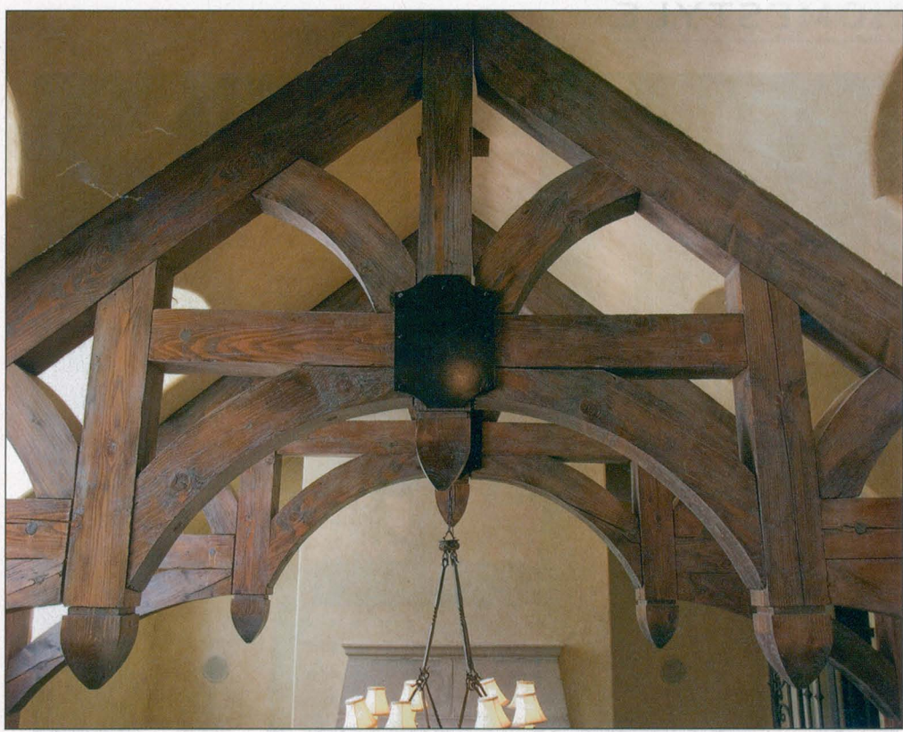
Dark, hand-hewn fir ceiling beams throughout the house contrast nicely with the home's soft color palette and add visual interest to the open rooms.

ted travertine marble floors in pale cream, rugs and furnishings in pretty pastels and tans, and softly glazed Venetian plaster walls create an airy atmosphere that is highlighted by the overhead framework of large hand-cut fir ceiling beams stained a rich, dark brown.